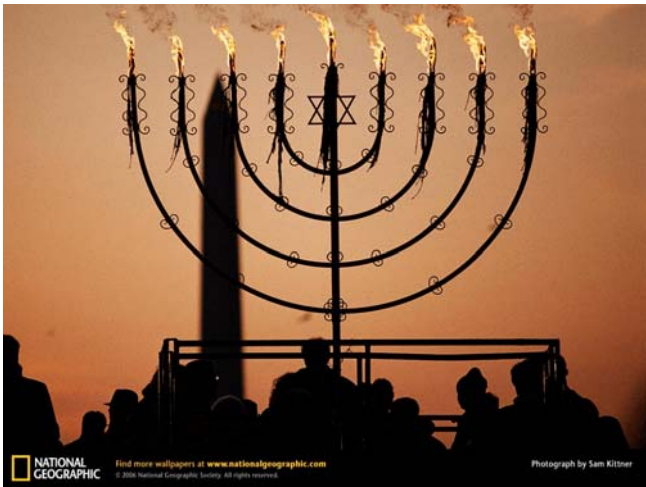
Washington DC Mall

(Text, photos and brachot compiled from various sources.)